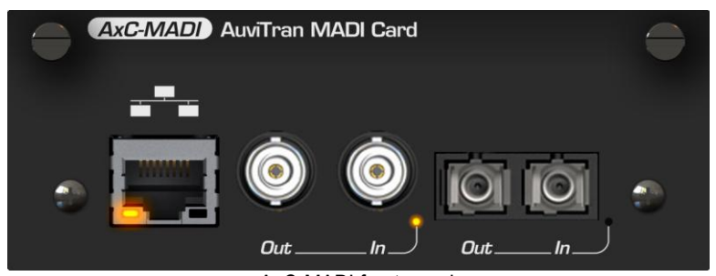
AxC-MADI front panel

MADI connection is assumed via Co-Axial cabling or Optical connector. Automatic selection is default mode and performed by AxC-MADI, but mode can be forced using setup interface. Network connector is reserved for future use.